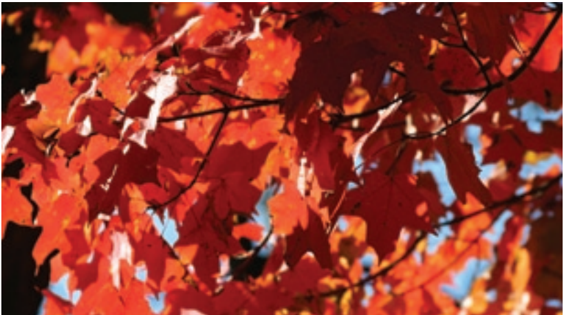
Colleen Crank, photographer