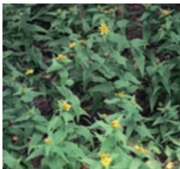
Robert Ritchie, Niagara Parks Commission

Woodland Sunflower is found in dry open forests, thickets, tallgrass woodlands and rock barrens. It should be planted in full to partial sun where there is good to excessive drainage.