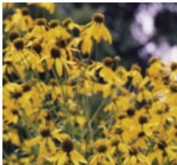
Robert Ritchie, Niagara Parks Commission

Green-headed Coneflower is found in moist, open areas. It should be planted in full to partial sun with moderate to poor drainage.