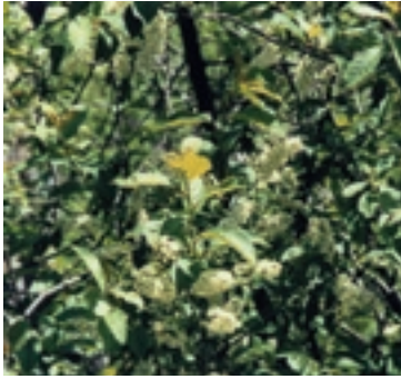
Robert Ritchie, Niagara Parks Commission

Meadowsweet is found in bogs, savannas, dunes, old fields, streambanks, wet thickets and roadside ditches. This species should be planted in full sun, as it is intolerant of shade. It can be planted where there is very poor to moderately poor drainage. Meadowsweet is resistant to drought and tolerant of flooding, but it is sensitive to salt.