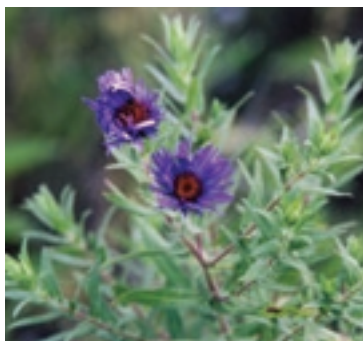
Robert Ritchie, Niagara Parks Commission

New England Aster is found in moist rich fields and wet meadows, swamps and along shorelines. It prefers areas that are more often moist than dry, therefore this flower should be planted in relatively open areas with moderate to poor drainage.