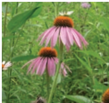
Eddie Jones, photographer