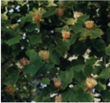
Robert Ritchie, Niagara Parks Commission

The Tulip Tree grows on dry slopes and upland flats with loose, moderately fine sandy soils. They also grow on sandy to medium loams that are well to moderately well-drained. They are very intolerant of flooding and are also sensitive to drought and heat. Once in the sunlight, they grow very quickly. Tulip Trees should be planted in deep, moist, fertile soils and in sun or partial shade.