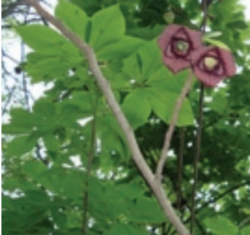
Eddie Jones, photographer