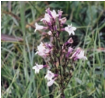
Robert Ritchie, Niagara Parks Commission

Foxglove Beardtongue is found in old fields, wet meadows, open woodlands or along the edges of woods. It should be planted in full to partial sun where there is moderate drainage.